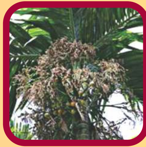
(Buuch) Areca catechu