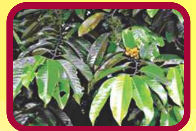
(Chersachel) Horsfieldia palauensis