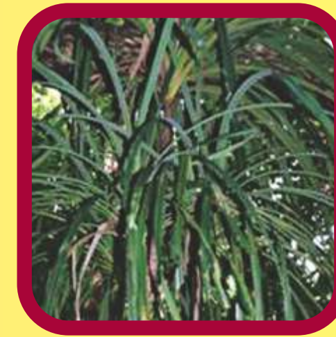
(Cherochet) Pandanus aimiriikensis