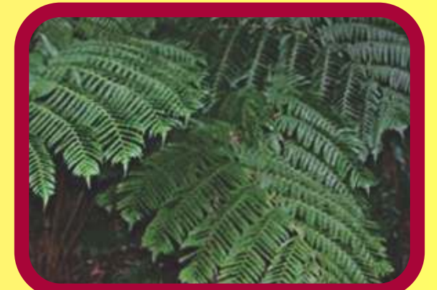
(Cheluu) Sphaeropteris nigricans