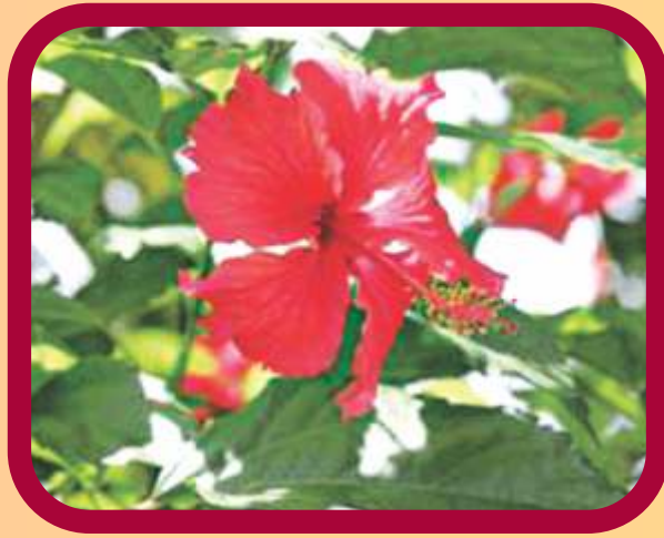
Bussonge Hibiscus rosa-sinensis