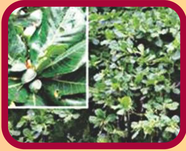
(Miich) Terminalia catappa