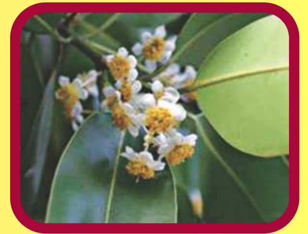
(Btaches) Calophyllum inophyllum