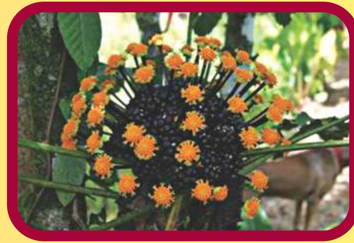
(Kesiamel) Osmoxylon oliveri