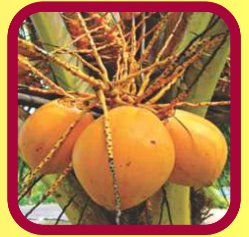
(Lius) Cocos nucifera