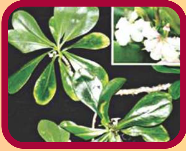
(Korrai) Scaevola taccada