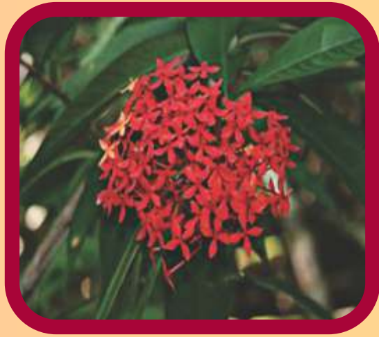
(Kerdeu) Ixora casei