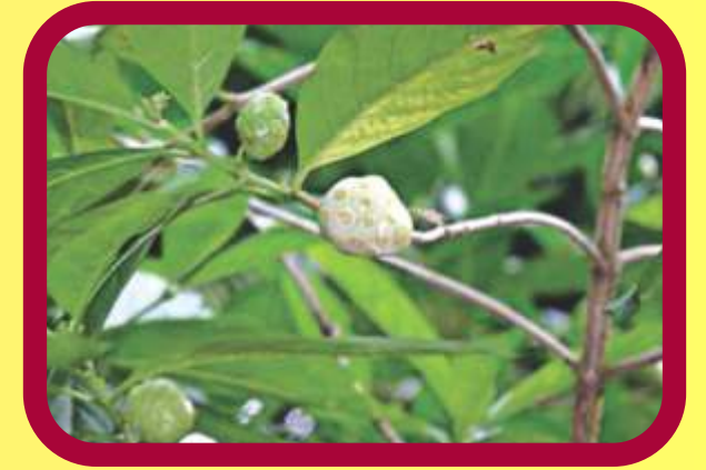
(Ngel) Morinda citrifolia