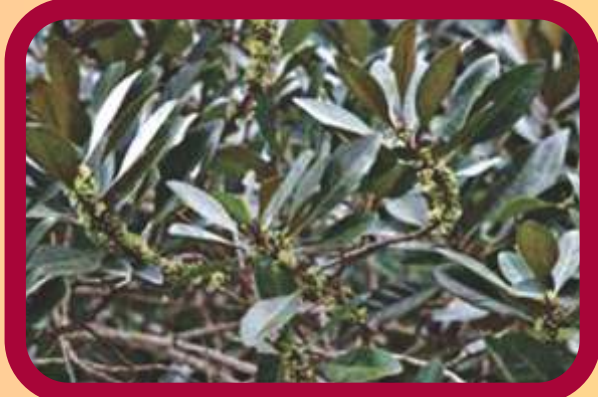
(Chelangel) Pouteria obovata