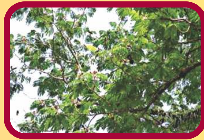
(Ukall) Serianthes kanehirae var kanehirae