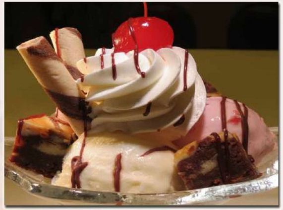
SUPER SUNDAE $ 11.00 スーパーサンデー