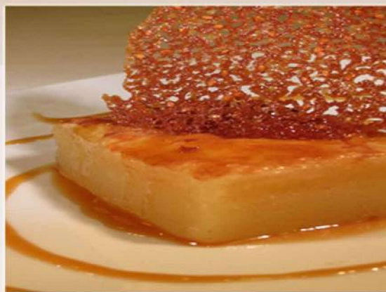
TAPIOCA CAKE $ 10.45 タピオカケーキ

All Prices Inclusive of 10% PGST & Subject to 10% SC