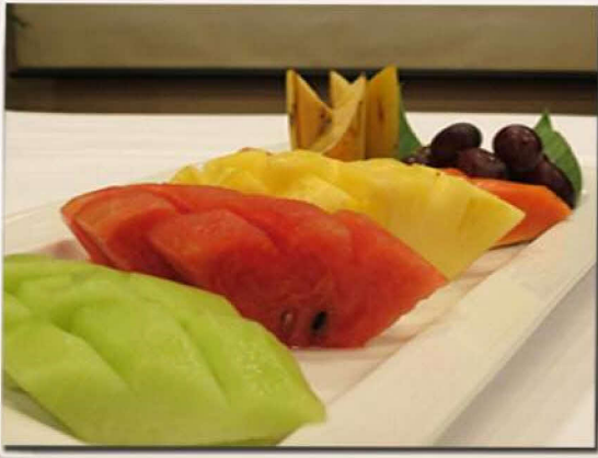
TROPICAL FRUIT PLATE $ 16.50 トロピカルフルーツの盛り合わせ