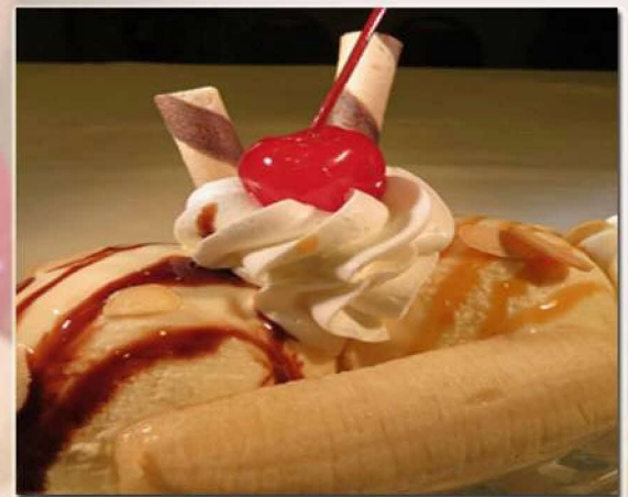
BANANA SPLIT $ 11.00 バナナスプリット