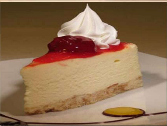
STRAWBERRY CHEESE CAKE $ 10.45 ストロベリーチーズケーキ