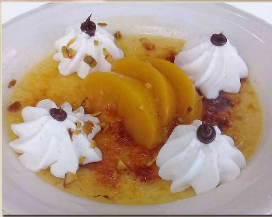
CREME BRULEE $ 11.00 クリームブリュレ