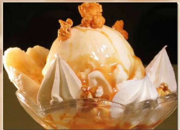
WARM BANANA CARAMEL PARFAIT $ 10.45 バナナキャラメルパフェ